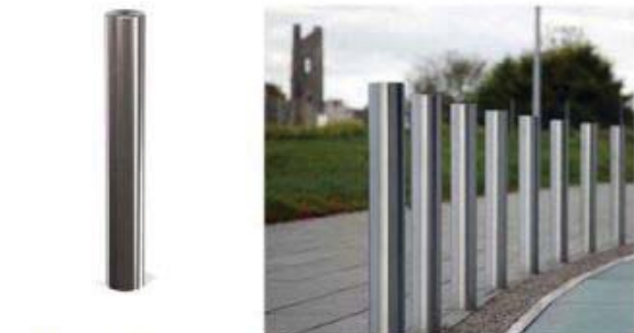
REMOVEABLE BOLLARD S/S WITH CONTRASTING COLOUR BAND