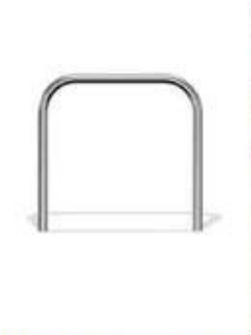
S/S SHEFFIELD CYCLE STAND