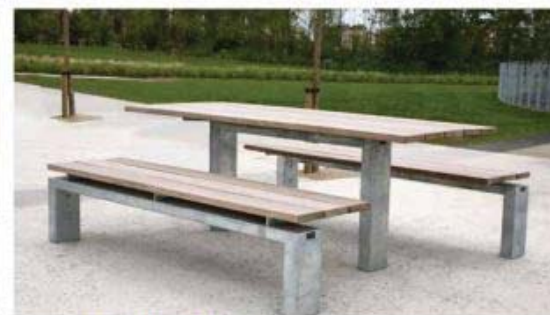
PICNIC TABLE SET