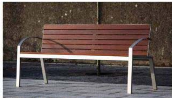
SEAT WITH BACK AND ARM RESTS