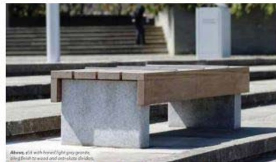
Aluminum with hand light grey granite, steel finish to wood and concrete details. BENCH SEATING WITH ANTI-SKATE FINIS